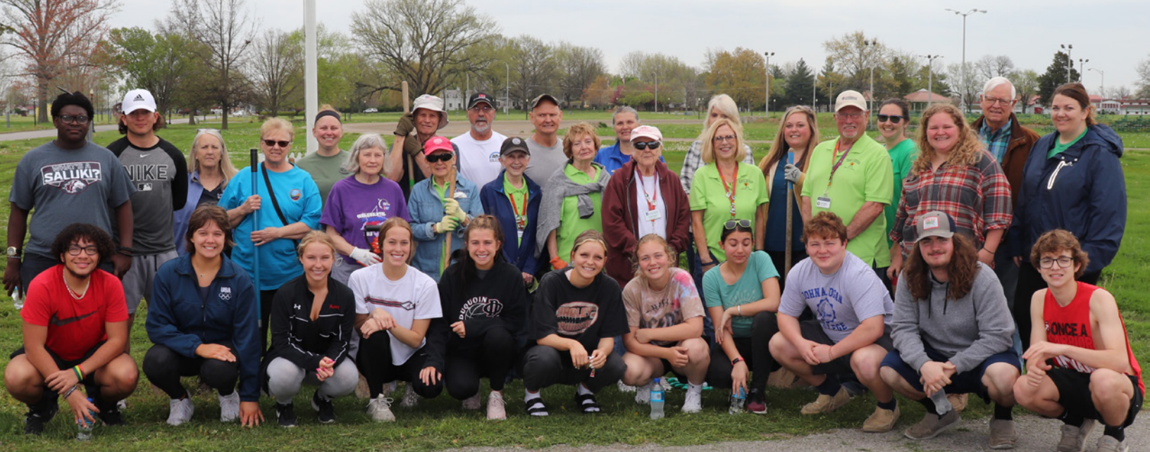
Staff, volunteers, and youth plant 100 trees at the DuQuoin State Fairgrounds on Earth Day.