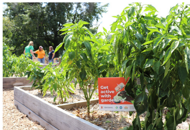
The cultivating care donation garden provides produce to local food pantries.