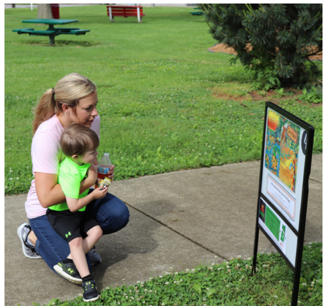
A community member reads a portion of Giraffes Can't Dance to her son during a book walk.