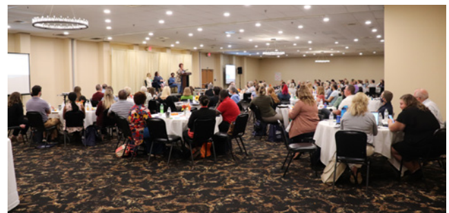
Community partners gather at second annual Food Security Summit.

Nourishing communities is more than just getting food to the table. It’s about recognizing that everyone deserves access to fresh, nutrient-dense food that is culturally relevant. Lt. Gov. Stratton