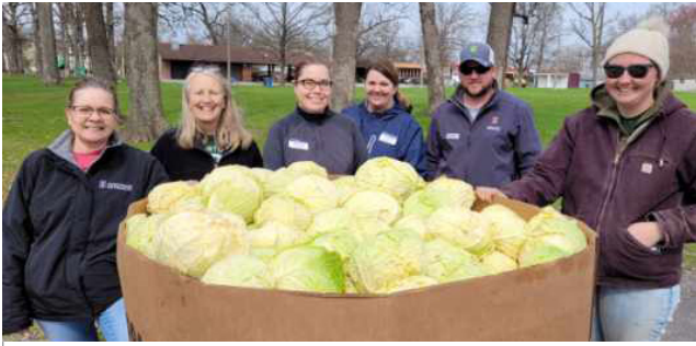
Volunteers distribute healthy food at mobile food markets.