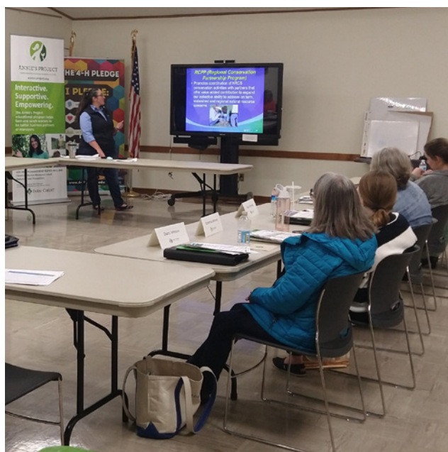
Annie's Project helps strengthen women's roles in modern farm and ranch enterprises.

Women may be an underrepresented group in agriculture, but thanks to a local course, participants receive support and guidance. Annie's Project is a national program with roots in Illinois. Co-created by a former Extension county director, the program empowers women through education, networks, and resources. Participants come together to learn from experts in production, financial management, human resources, marketing, and the legal field. Annie's Project covers many topics dedicated to strengthening women's roles in modern farm and ranch enterprises, including business plans, crop insurance, diversifying farm operations, estate planning, and farm appraisal. The six-week series is an excellent opportunity for women at all levels of agriculture. Those just starting out and seasoned farmers come together to learn, network, and receive support from one another. The program helps women in agriculture become change agents who will strengthen their businesses, families, and communities.