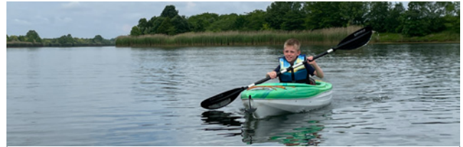
A 4-H member enjoys kayaking at Pyramid State Park during the Kids in the Park summer program.