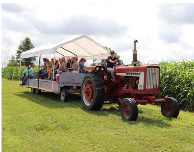
People movers transport participants around the grounds at Ewing Field Day.

Ewing Demonstration Center has served the local community since 1910. From the beginning, it was a place where area farmers and agricultural professionals worked with University researchers to develop and implement research that would benefit the local farming community. The center has featured no-till research and demonstration plots for over 50 years, offering representative growing conditions for southern Illinois. The center continues the tradition of annual events, including Ewing Agronomy Field Day. Educators and campus faculty visit the research grounds to answer questions and provide best management practices for local growers. Students from area high schools and community colleges attend the Agricultural Careers and Technology Field Day each fall where industry leaders answer talk to students about what they look for in potential employees. Students interested in pursuing higher education can speak directly to recruiters and collect resources from community colleges or universities that offer ag programs.