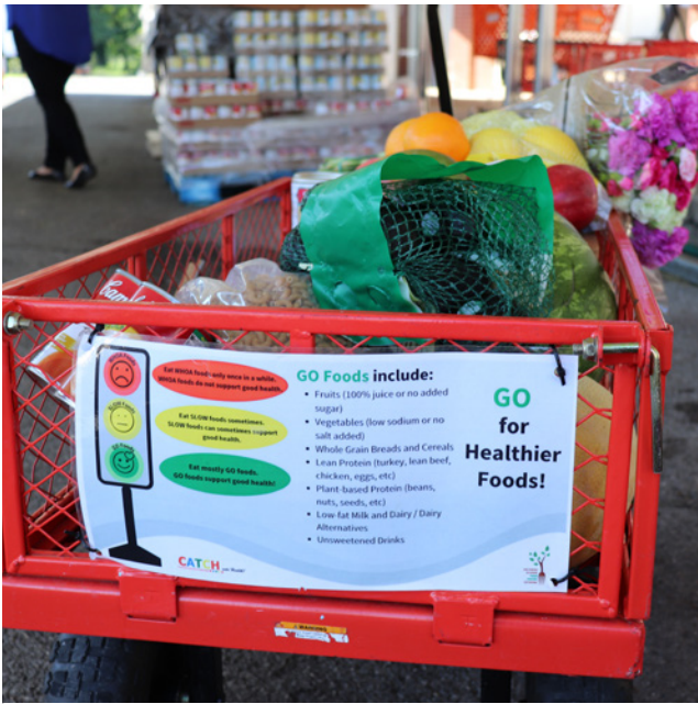
Go, Slow, and Whoa messaging helps guide food pantry clients to healthy food choices.