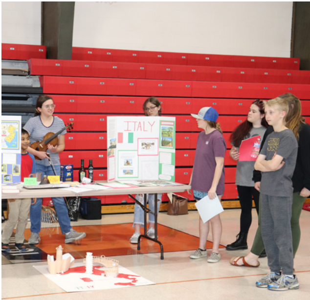
Local youth build a gondola and a tabletop display to showcase the country of Italy.

We're all part of a great big world, and intercultural programs help 4-H youth explore new cultures and countries. In the fall, Jackson County 4-H hosted monthly heritage workshops. The programs allowed youth to explore the beliefs, cultural norms, and views of different backgrounds. The annual passport party promoted cultural enrichment in Perry County as 4-H members learned more about a different country or state. 4-H clubs work together to research the assigned region and put together an informative display. Community members are invited to view the 4-H table displays while they share cultural facts during the open-house-style event. The program has been a staple of the community for over two decades and is a great way to inspire youth to continue their journey of cultural awareness.