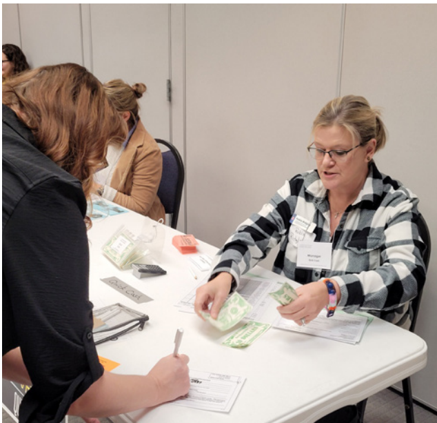
The poverty simulation shed light on the struggles faced by those with low income.

A major illness or sudden loss of employment can be catastrophic, and those who are ill-prepared could fall into poverty. Financial instability can negatively affect physical, mental, and social health. Illinois Extension helped facilitate a poverty simulation at Stronger Together 2022, a conference focused on healing and wellness. During the immersive experience, participants did their best to survive week-to-week simulating real-life scenarios and obstacles while they “lived” one month in poverty. The simulation highlights the day-to-day challenges faced by those living in poverty and how current systems, policies, and practices may create barriers. Viewing poverty through this lens helps raise awareness, increase understanding, transform perspectives, and inspire local change.