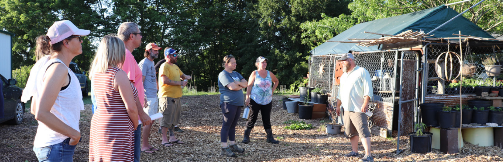
Participants visit Glacier's End Farm during a summer twilight meeting.