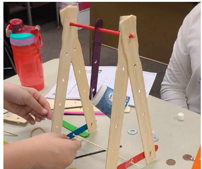
Local students create marshmallow catapults during a junk drawer robotics program.

Creativity, collaboration, and critical thinking are the recipe to success with STEAM projects, and 4-Hers are twice as likely as other youth to want a science-related career. Even better, 4-H members are twice as likely to say they're 'good at' science compared to their peers.