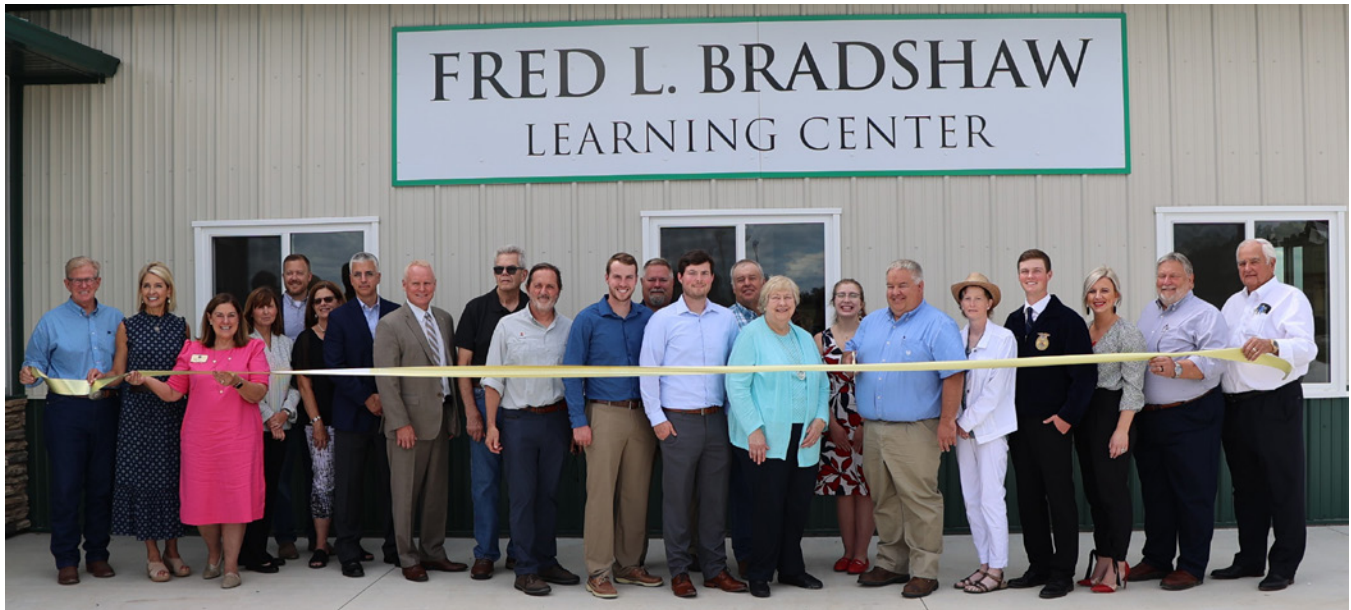
Ribbon cutting event at the new John Wood Community College Agricultural Sciences Complex in Baylis.