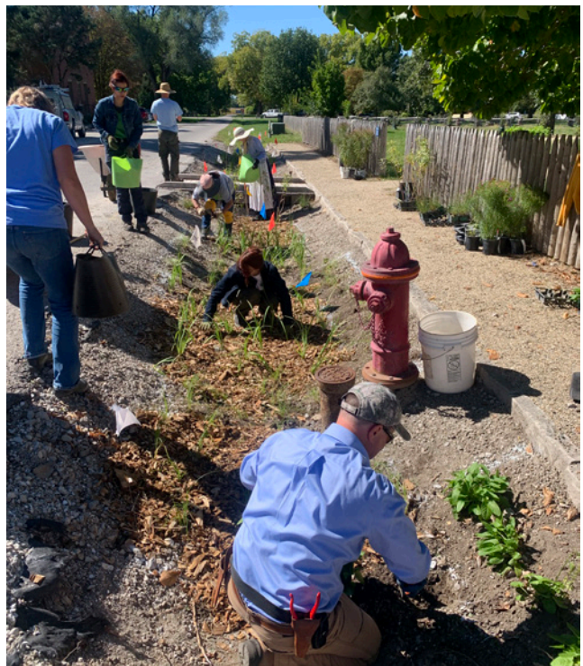
Attendees of the Rainscaping Workshop Series put their skills into action constructing a rain garden in Nauvoo.