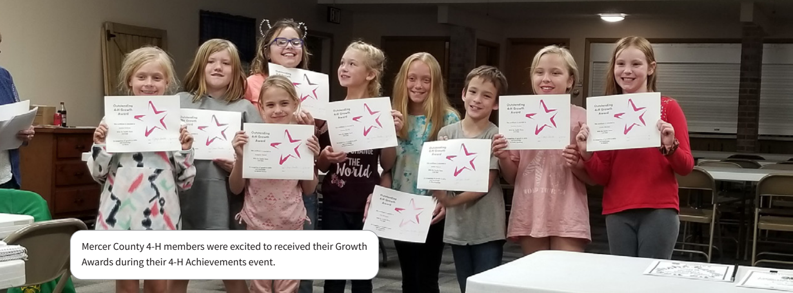
Mercer County 4-H members were excited to receive their Growth Awards during their 4-H Achievements event.