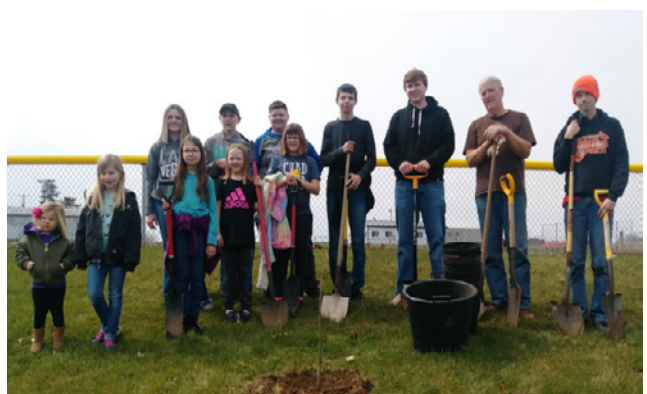
Members of the Stark County Century Clovers planted trees at the high school in Toulon as part of the Greener Communities Project.