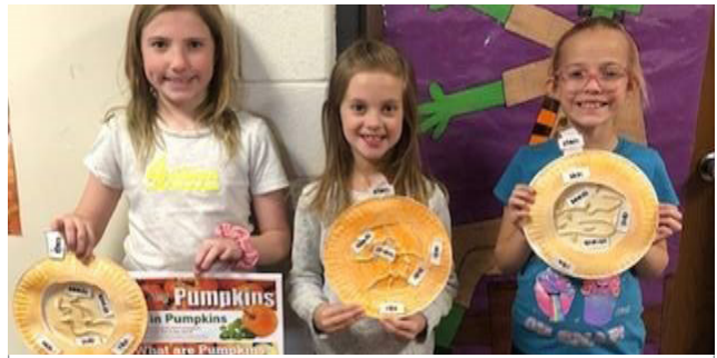
Students enjoy learning about topics such as pumpkins during classroom visits from the Mercer County Ag Literacy program.