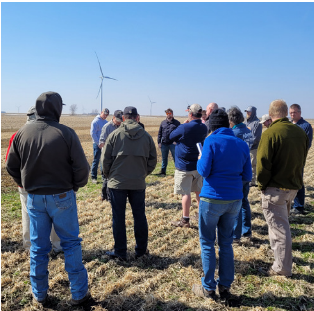
Participants at the March 2022 Bi-State Advanced Soil Health Training will now be able to assist other farmers.