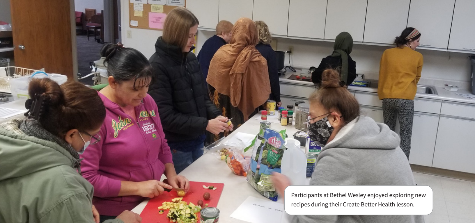
Participants at Bethel Wesley enjoyed exploring new recipes during their Create Better Health lesson.