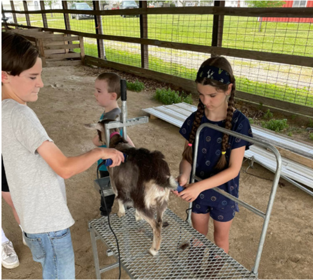
The Goat SPIN Club gave youth the opportunity to learn how to care for and show goats in the show ring.

Project Focus Series: Illinois Extension held a series of workshops and special interest clubs in 2022 to give youth skill-building opportunities in specific 4-H project areas. Youth learned through hands-on experience from community members or 4-H staff with expert knowledge in the project area. The goal of each workshop was to give kids a good start on a project they could exhibit at their county fair. Workshops included cooking 101, jewelry making, visual arts clay, goats, CPR and health safety, sewing, fishing, food preservation, portrait drawing, photography, and shooting sports. These workshops helped 250 youth work on projects, build confidence, and learn new things.