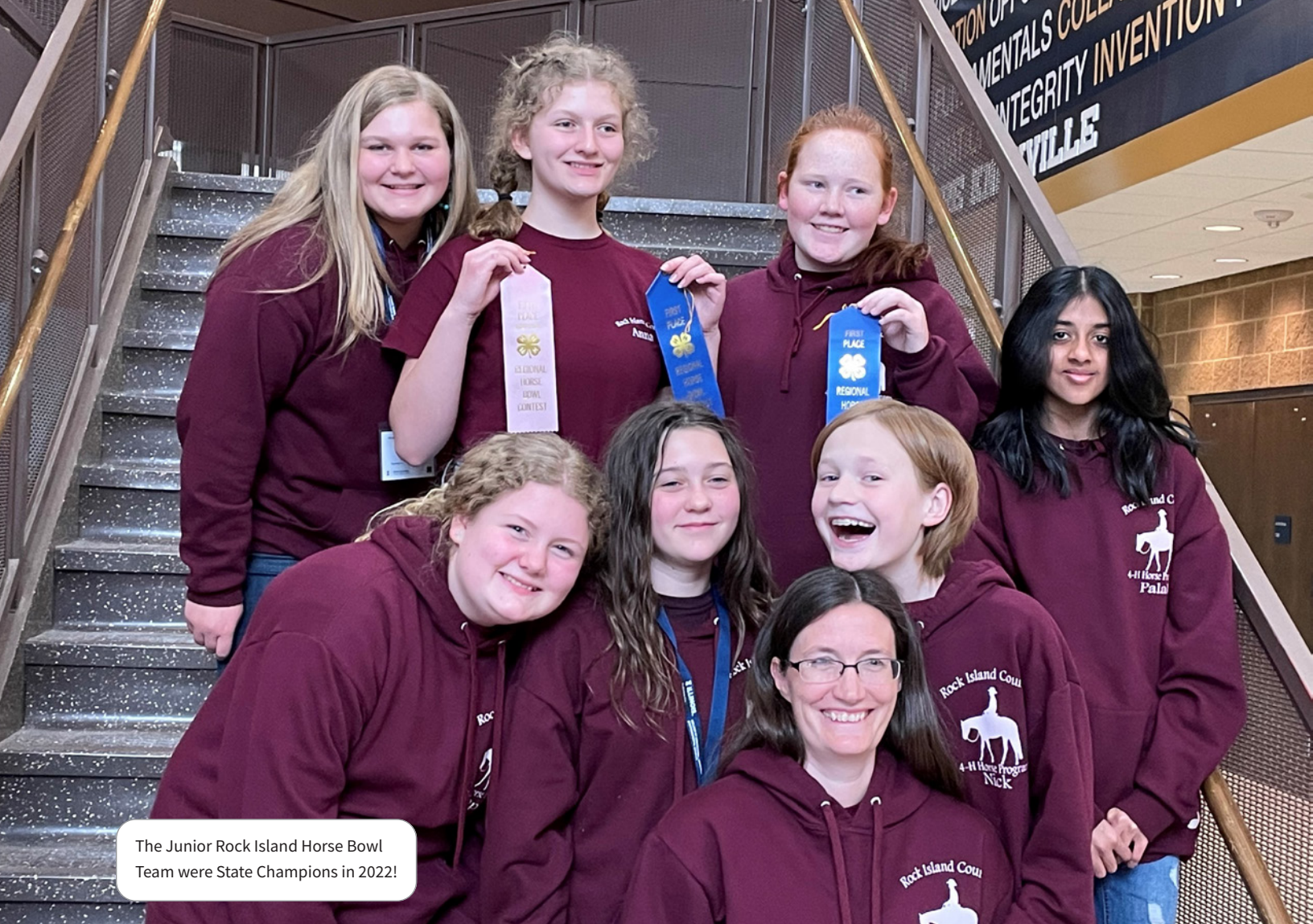
The Junior Rock Island Horse Bowl Team were State Champions in 2022!