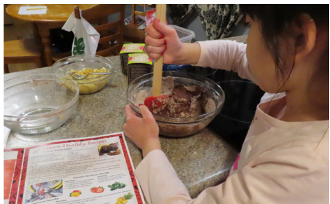
The “I Made That” series gave youth the chance to build their cooking skills through lessons and resources they can do at home.

The popular program was enjoyed by 141 youth with an additional 1,500 booklets distributed through 4-H and public libraries across four counties. The unit now has a full year of education cooking kits that can be used for future programs.